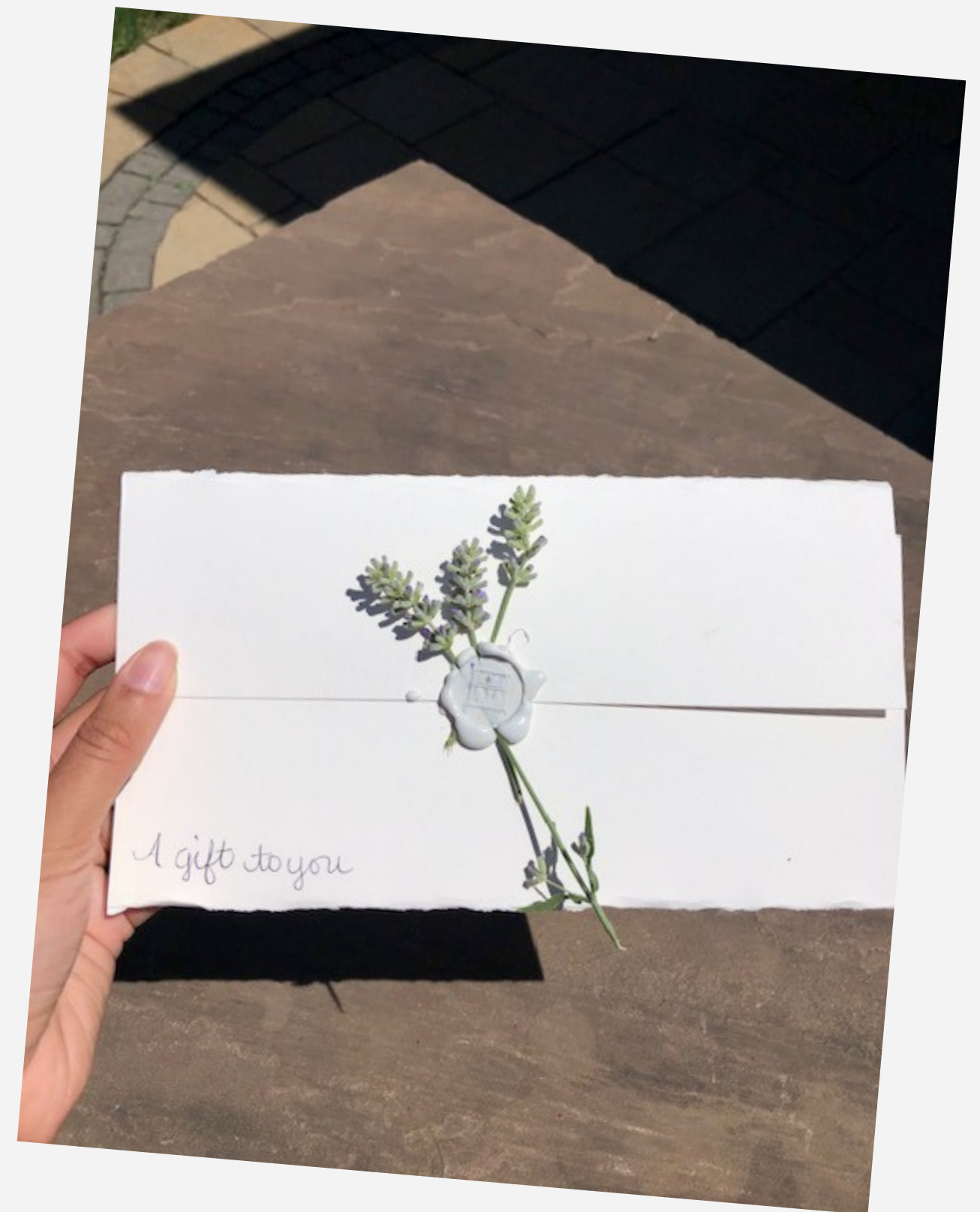
Art response and an example of a letter